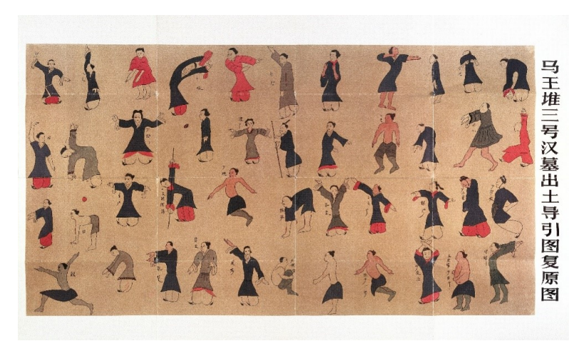
Fig. 2 Reconstructed image of the Daoyintu.

Although not included in the reconstruction, there are two sections of text to the right of the daoyintu .