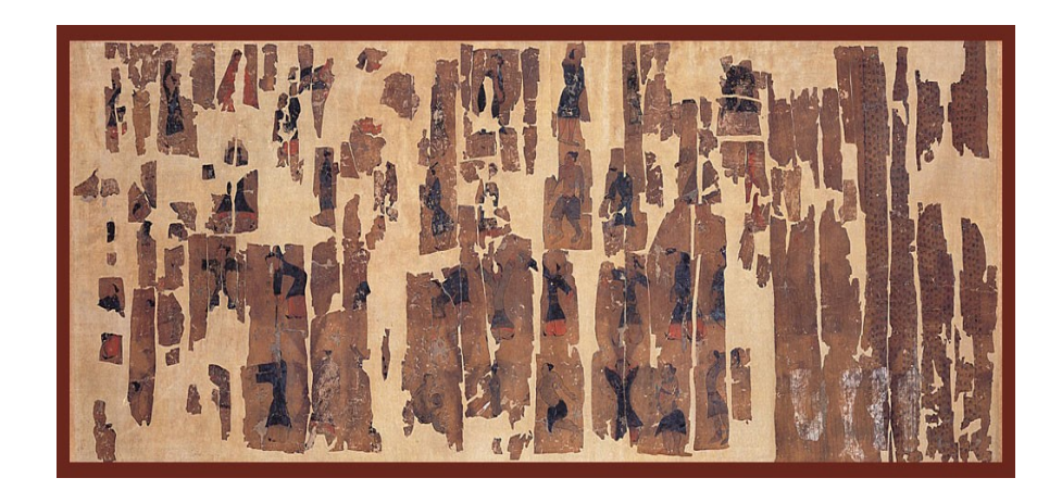
Fig 1. Original Mawangdui silk drawing.

By the third century BCE., ideas concerning the mai \mathbb{R} (vessels) filled with blood and qi \mathbb{R} (vapor) inside the body dominated physiological speculation; one definition of health was the maintenance of a constant supply of free-flowing blood and vapor in the vessels. (2009, 69)